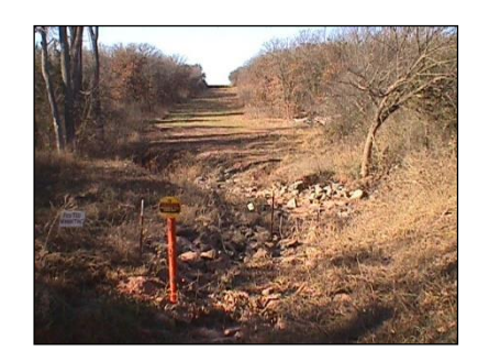
Example of marker