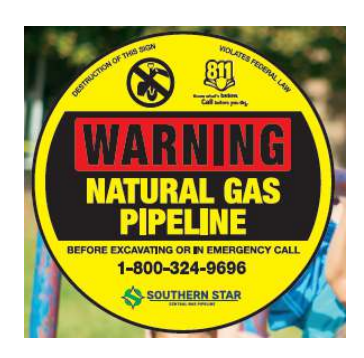
Typical marker sign

The maintenance of pipeline markers and an open clear right-of-way at all times is critical to public safety. Construction or development near transmission pipelines increases the probability of excavation damage. It is the responsibility of Southern Star, individual landowners, and contractors to ensure that all temporary and permanent pipeline markers installed by Southern Star are protected and maintained at all times, especially during construction. Removing or defacing a pipeline marker is a federal criminal offense.